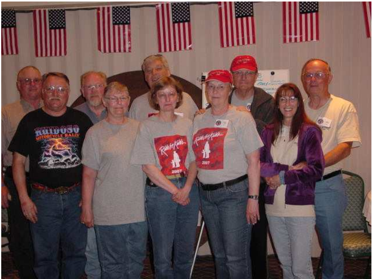
2008 MTA GATHERING Submitted by Missouri Chapter 1

G uess it's about time to do a trip report before I forget the details of our trip to West Virginia, known as the "Top of the Mountain State". As the saying goes, prior planning prevents poor performance. In this case we decided to do a minor tune-up replacing the spark plugs which is another story. The day before our departure, however, we noticed the rear tire was getting worn and discovered it had reached a point where it would not make the trip safely, so it was off to BMW early Saturday morning for a replacement. Once the new tire was re-mounted, it was home to reinstall and finishing loading the bike. Then it was off on our week long adventure heading east on MO 210 and gradually working our way toward I-70 and points east.